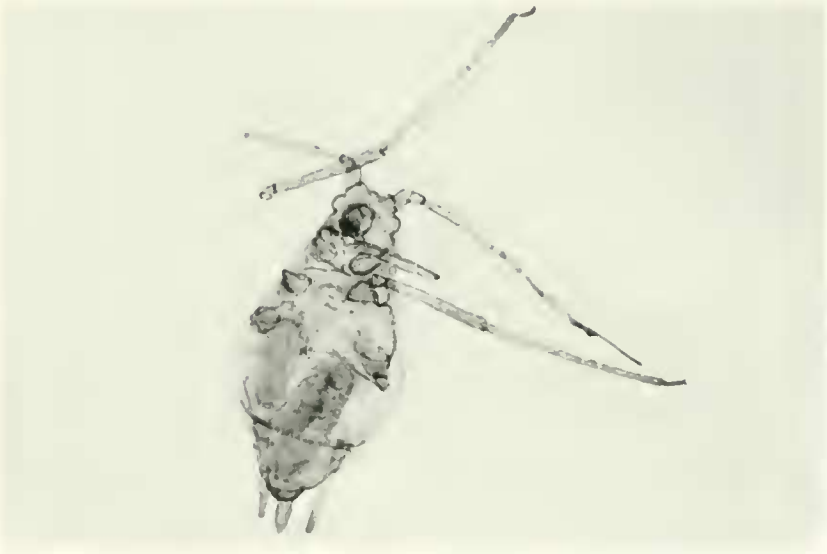
Fig. 3. Morphotype of Capitophorus corambus on slide #10658, INHS (6.25 \times ).

consider Capitophorus corambus Hottes & Frison a synonym of Hyperomyzus ( Neonasonovia ) ribiella (Davis).